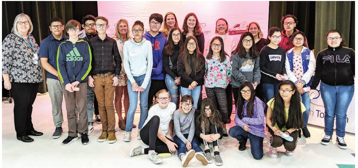
Life is better in glasses

Vision To Learn, a non-profit charity, started with one van in Los Angeles in 2012 and now helps kids in low-income communities in over 300 cities in 13 states; about 90% of kids served by Vision To Learn live in poverty and about 85% are kids of color. Since its inception, Vision To Learn has helped provide vision screenings to over 1,000,000 kids, all free of charge. For more information on Vision To Learn, please visit www.visiontolearn.org .