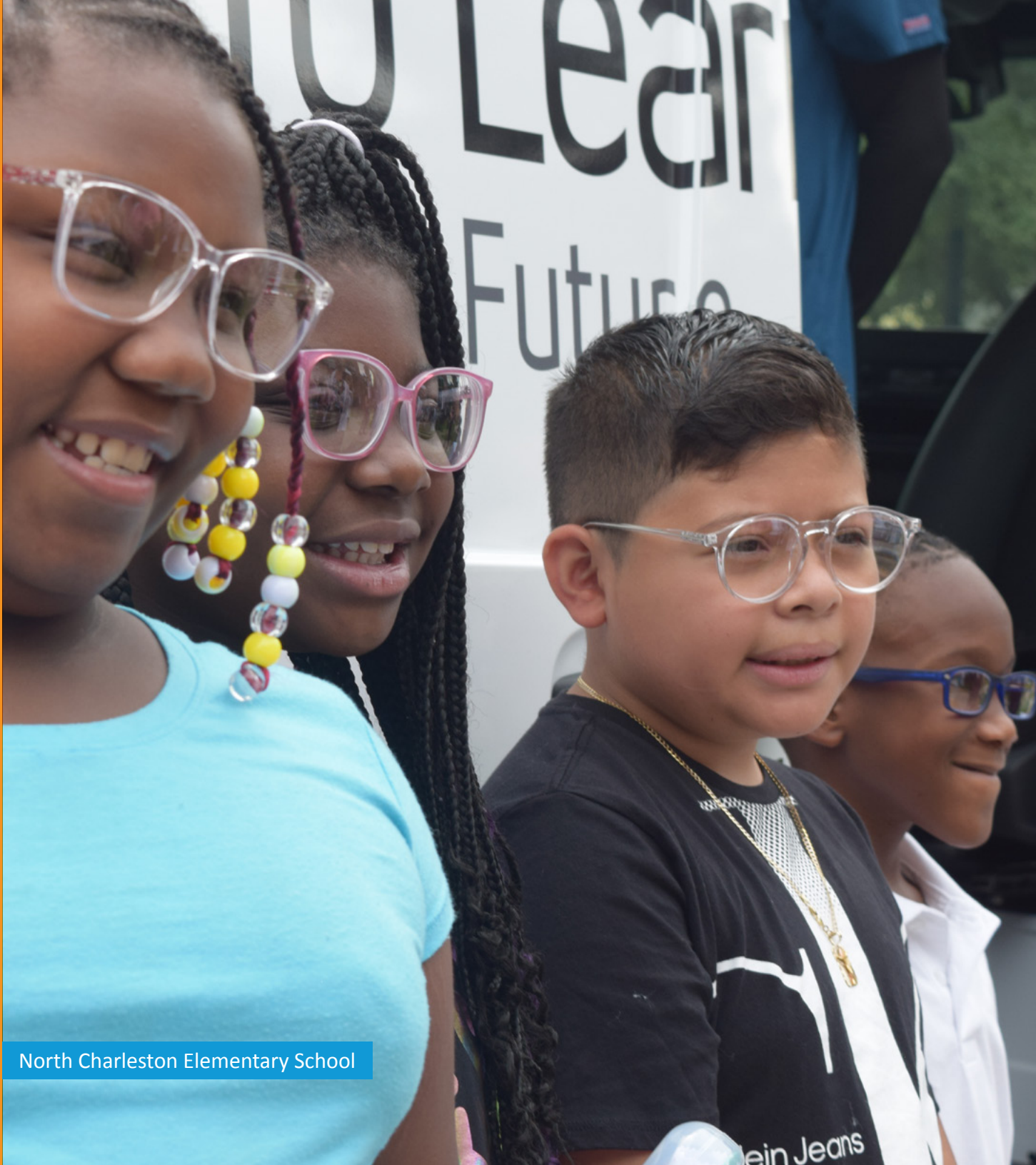
North Charleston Elementary School