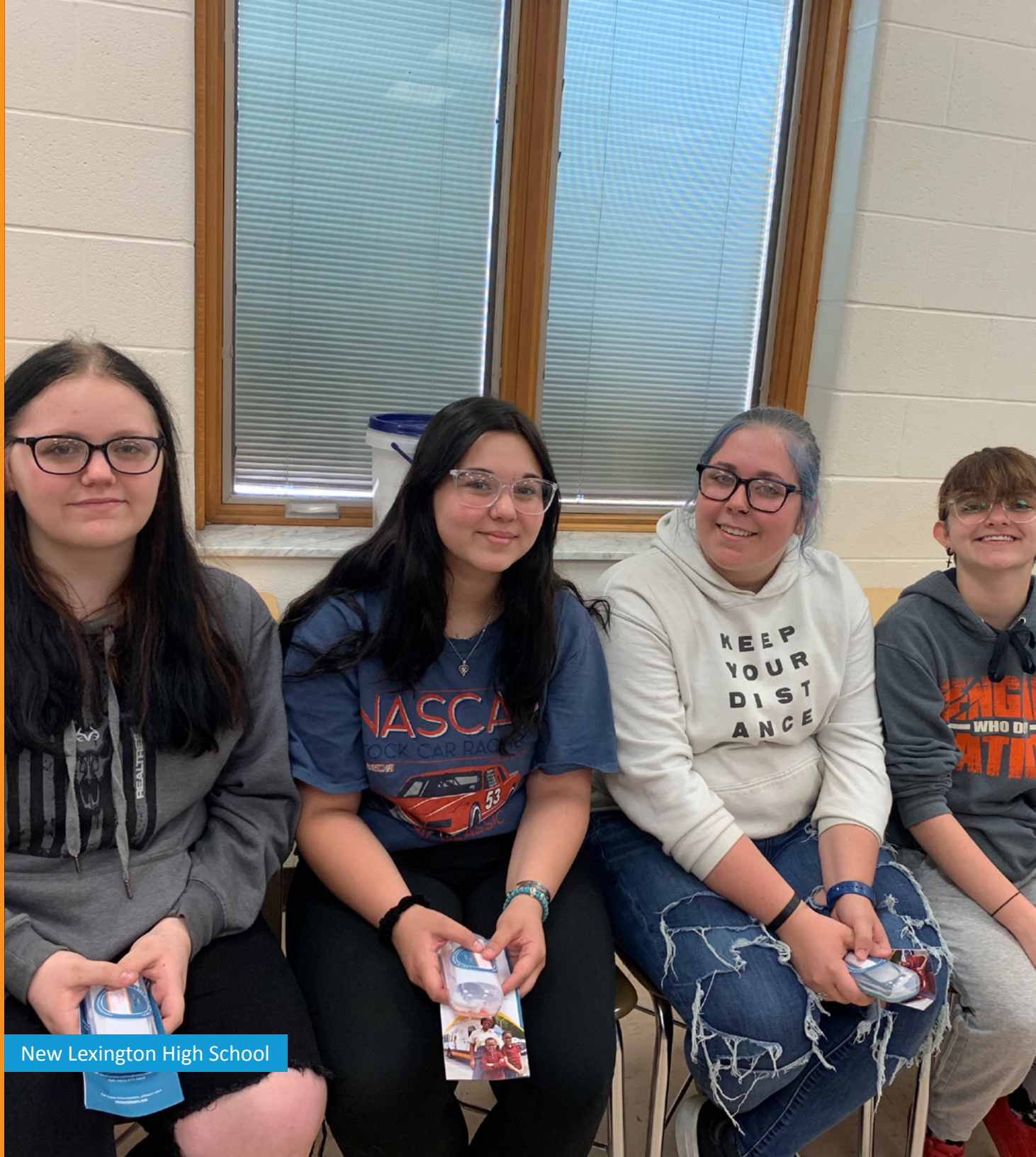
New Lexington High School