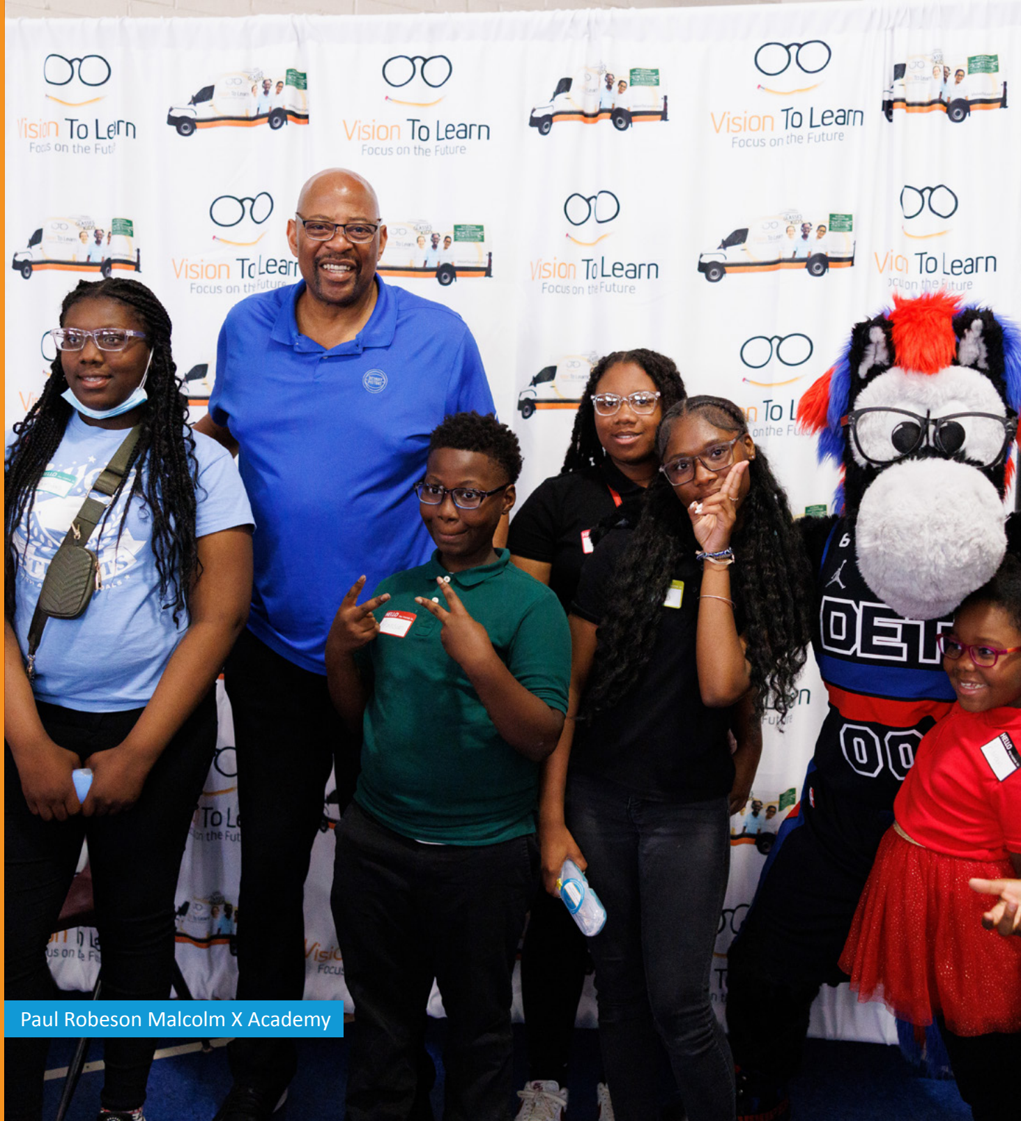
Paul Robeson Malcolm X Academy