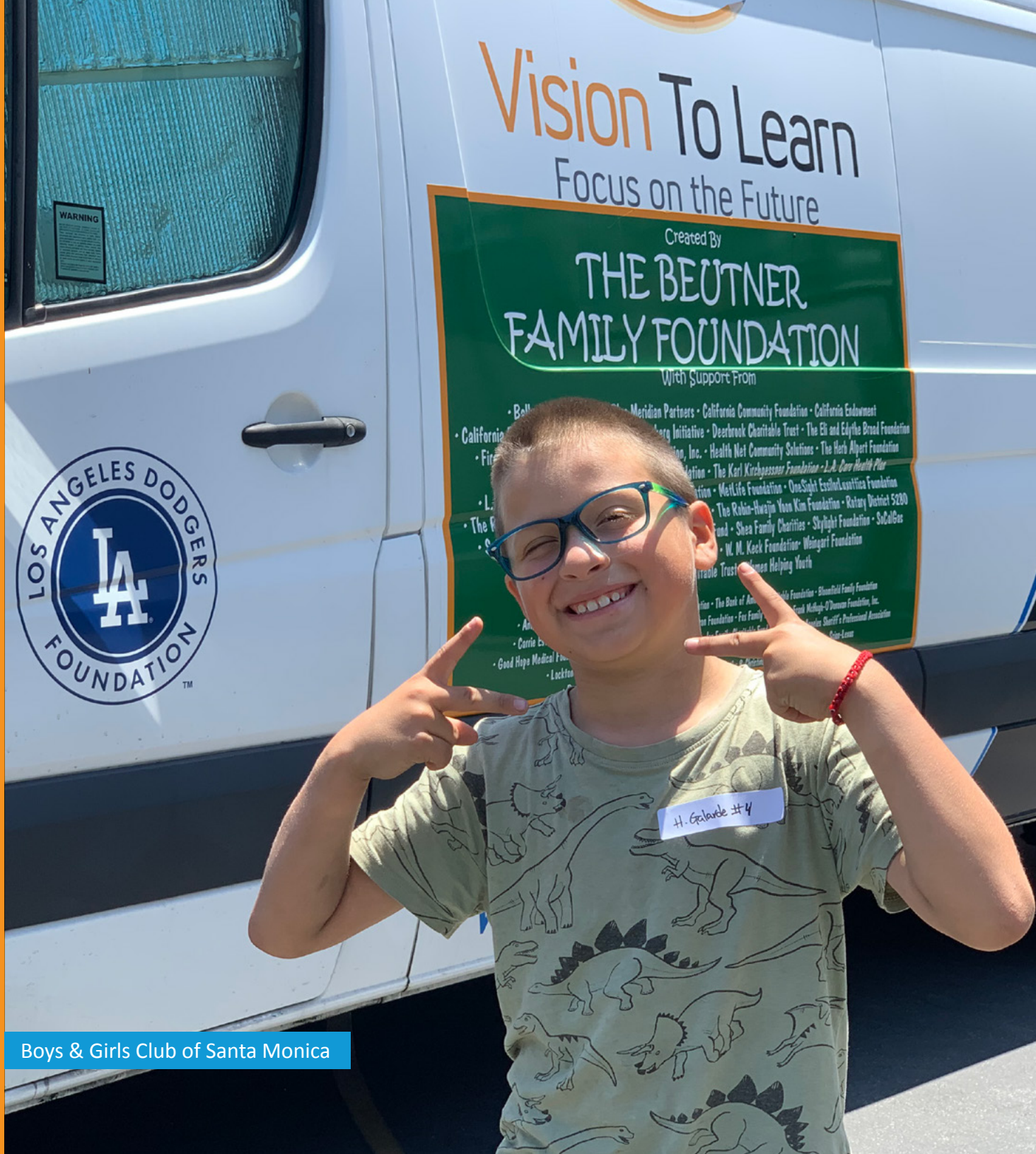
Boys & Girls Club of Santa Monica